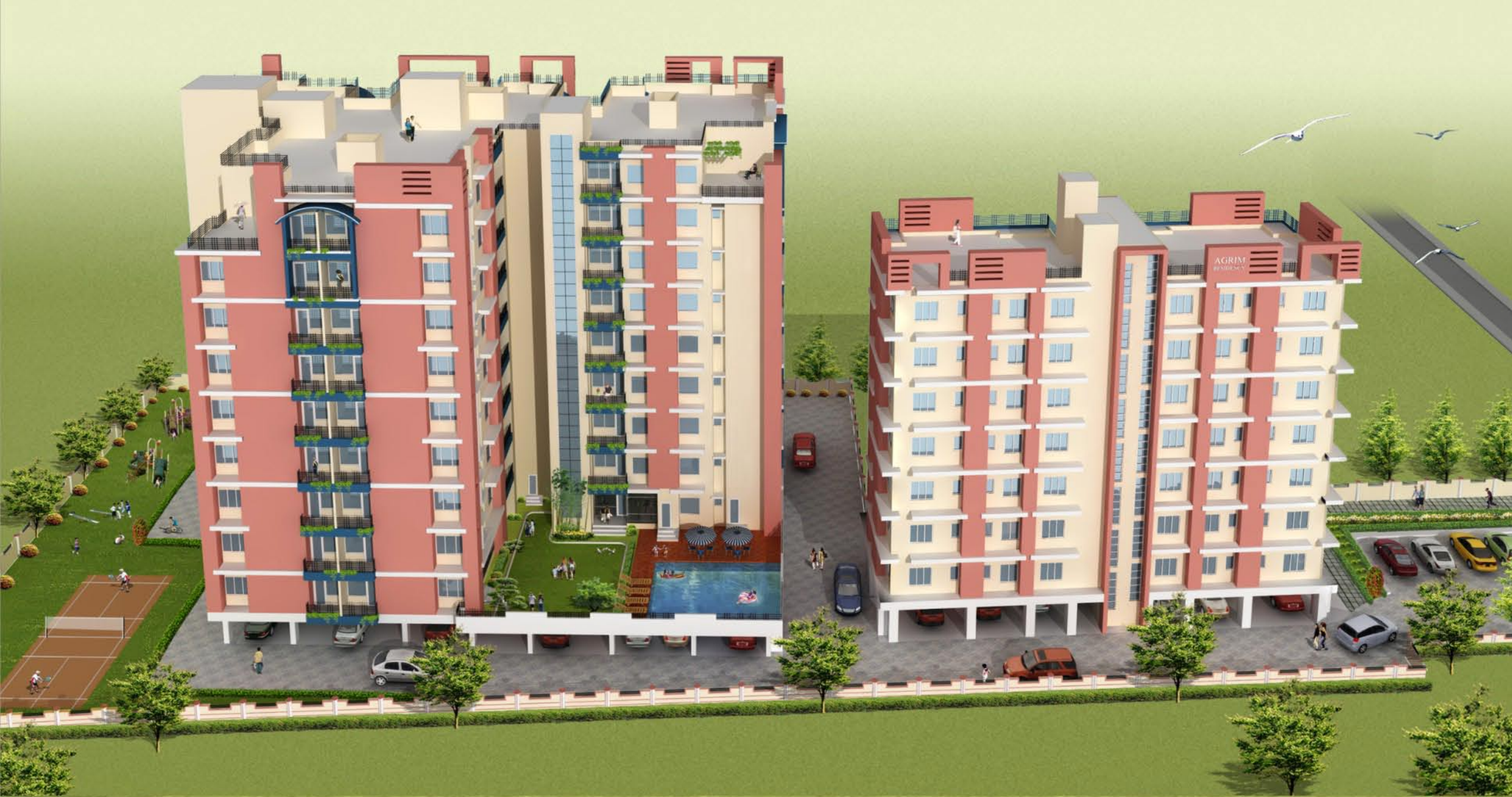
AGRIM RESIDENCY Recent Project in Guwahati

Agrim Residency is a residential project on Janakpur Road, Jatiya, Kahilipara. It is spread over an area of 3 Bigha and 6 Lechas (Around 44000 sq.ft.) providing high quality living experience for its inhabitants. The site is just 2.5 km from Ganeshguri chariali and is in close vicinity of Schools, Colleges, Market, Hospitals and Banks. The project consists of 74 Flats with a mix of 2 BHK, 3BHK and Penthouses. 74% of the space is open in order to provide a fresh and airy environment to its residents. The project is near to completion and would be delivered in second half of 2011.